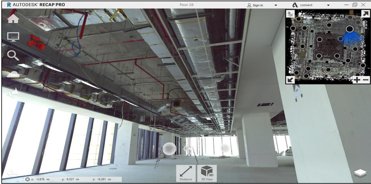
Figure 1: Admin building Ceiling MEP system elements

The required areas in the admin building have been covered with the spatial resolution and required accuracy by scan data. The scanning device contains the necessary instruments such as a camera to capture red, green and blue colors in order to capture other properties. In addition, the locations of scanning have enabled a sight line from the scanning device to the target required to be captured these properties. The option to enable or disable a sensor by setting scanning parameters has been determined according to the system components priorities. Having more scanning locations with shorter distances, higher angular resolutions and lower incident angles satisfy the desired scanning data coverage, accuracy, and spatial resolution. However, this scanning process causes more efforts, time consuming and produces redundant scanning data. So, based on Construction Engineering Technology Lab (CETL) team expert judgment, site study has been conducted to find the near optimum scanning parameters with the minimum number of scans and also satisfying the required scanning data quality. For a specific scanner position, the amount of horizontal and vertical repetitions which determine the laser scanner positions is considered to be from range 2 to 20 repetitions. The constraint of the max spacing is utilized to range between 4 and 6 millimeters and 60^\circ is the max used incidence angle and the scanning resolution is considered to be the final optimization parameter [19].