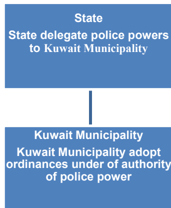
Fig.2: Building Control Police Powers

Article no. 19 from Kuwait Municipality Law shows that Municipality responsibilities to the work for the growth and advancement of building construction and public health, article no. 20 to organize building permit, and article no. 34 to the development of rules and principles of building construction.