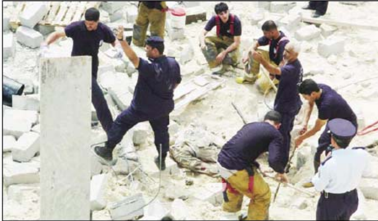
Fig. 1: Killing of two construction workers and two seriously injured in basement collapse under construction in Desma town in May 7, 2006

(AL-Sherhan, 2006). The consequences of the accidents caused death of two worker and two injured one of them seriously injured. In addition, the accident causes huge financial loss. Reinforce concrete structures should design and construct by approved standards and qualified contractor. The problem in Kuwait is that there are no solid regulation and enforcement mechanism that can be enforced by building official to prevent these incidences. This leads to the conclusion that current Building Regulations in Kuwait are insufficient to protect public health, safety and general welfare.